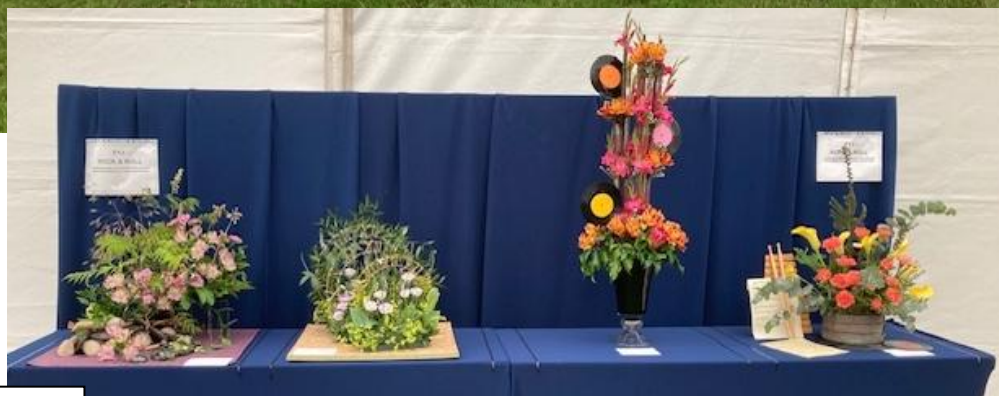
People’s Choice Award to the Knutsford Team